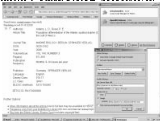
Figure 3. Selecting a Resolver with OpenURL Referrer

An extension to the Firefox Web browser, such as Openly's OpenURL Referrer [13], allows a user to personalise their OpenURL linking via their chosen OpenURL resolver. A list of resolver profiles, each including either a button image or link text, can be registered in the OpenURL Referrer, then a particular one selected for current use, a choice that can be changed easily to suit the occasion and environment. After this selection, a COinS-aware application will show a link to the resolver of choice. Activating this link will send the ContextObject, containing the citation details, to the chosen resolution service. Figure 3 shows the process of personalisation by selection of The University of Manchester's 'FindIt@JRUL' SFX resolver.