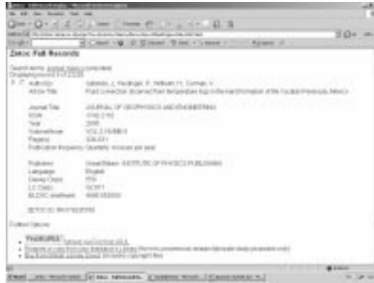
Figure 1. A Zetoc Full Record page for a Discovered Article