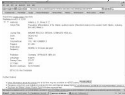
Figure 4. A Clickable COinS Button and the Hidden ContextObject

Within Zetoc, if OpenURL Referrer has been profiled with a user's choice of OpenURL resolver, using Firefox they will see the relevant button or link at the side of the OpenURL link. Clicking on this button, rather than their institution's (if one is shown) will take them to their chosen resolution service. Figure 4 shows a Zetoc full record page, as would be seen at an institution with no resolver, with a 'FindIt@JRUL' button, which will send the hidden ContextObject to the University of Manchester's resolver.